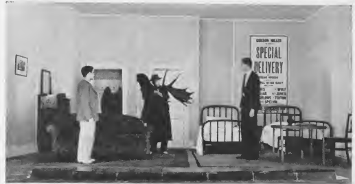
1937— Room Service —Oct., 1938*